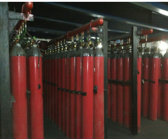
Reliance Sasan Project