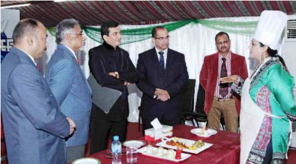
"Star Chef Contest" with Chef Sanjeev Kapoor and team of Spicy Village Restaurant - Muscat