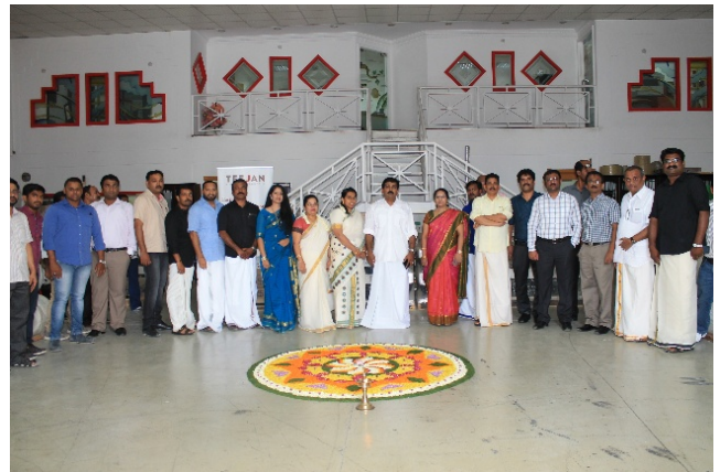
Celebration of Onam