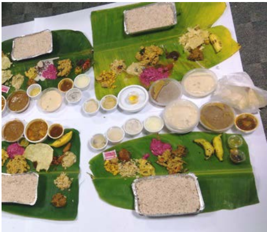
Foods @ Onam