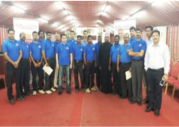
Manappat Foods – Arctic Gold Sales Team