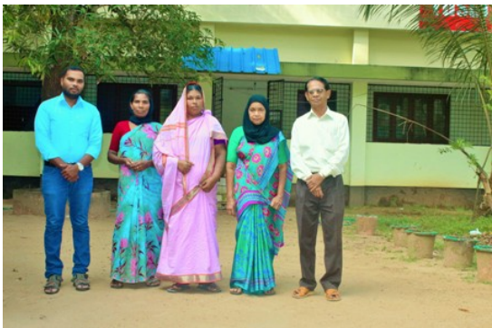
Manappat Foundation Team, Cochin, India