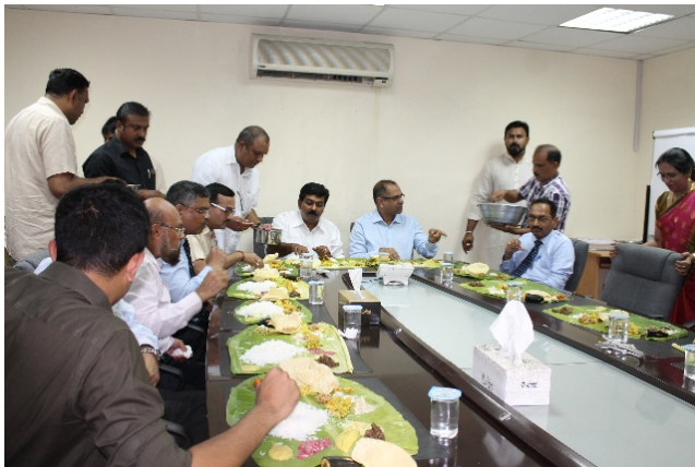
Lunch at Onam