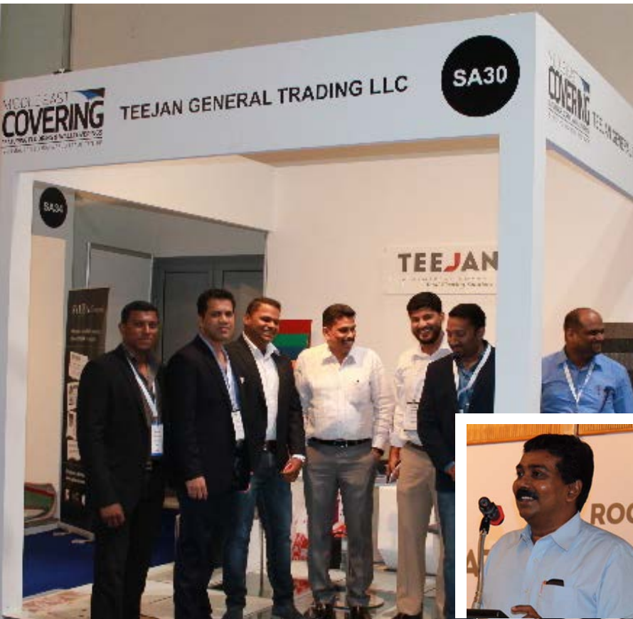
Exhibition :Flooring Division of Teejan participated in Index 2015.