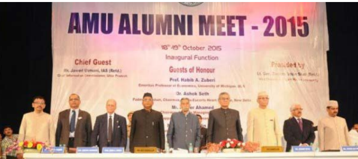
Guests at AMU Alumni Meet paying homage to motherland India.