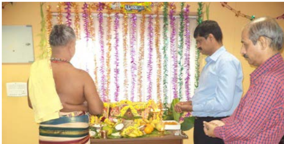
Pooja celebrations at Agnice Fire Protection, Chennai - India