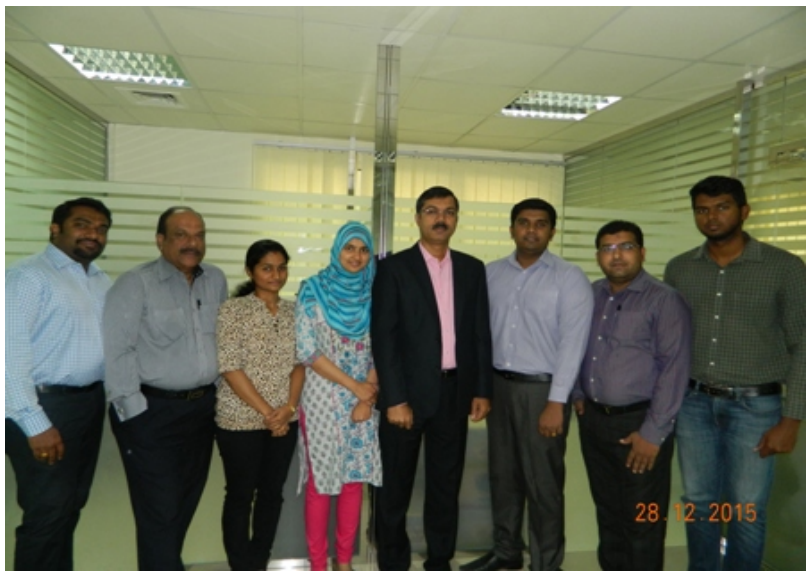
Rooftek Insulation - UAE