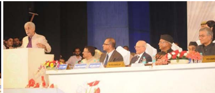
Noted Bollywood film actor Mr. Naseer Uddin Shah addressing the alumni meet.