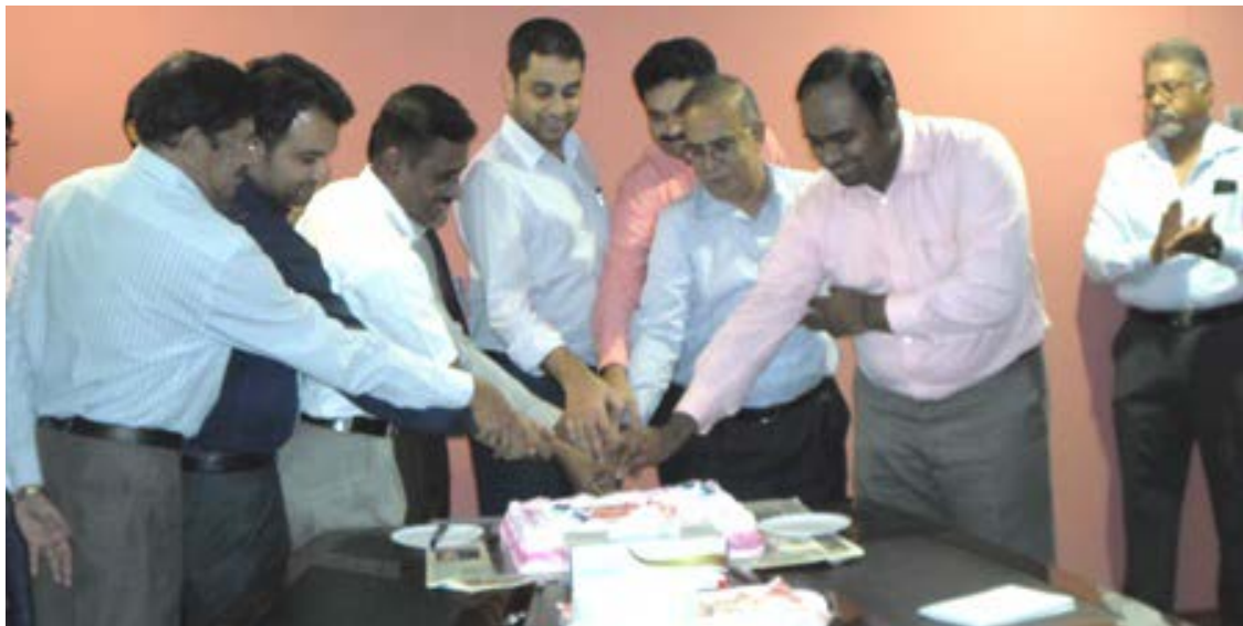
Award Celebrations : Agnice Oman celebrated the awarding of Outstanding Business Partner of Tyco Fire Protection Products and Strategic Product Award from Simplex in recognition of executing Salalah Airport Project.

Agnice International & Partners LLC. - Oman