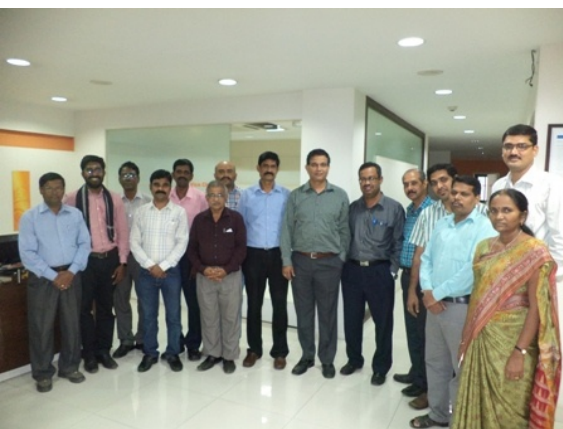
Agnice India - Team

1. M/s. BGR Energy System Pvt. Ltd for Supply & Supervision of ITC for FDA System for OPGCL's 2 x 660 MW TPP at Odisha for a order value of Rs. 17,369,847/-