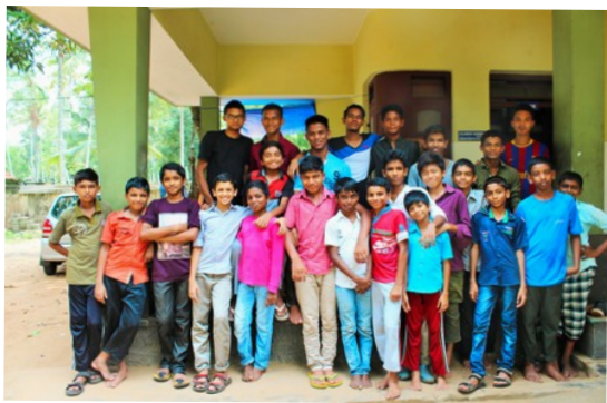
Kids from Manappat Foundation